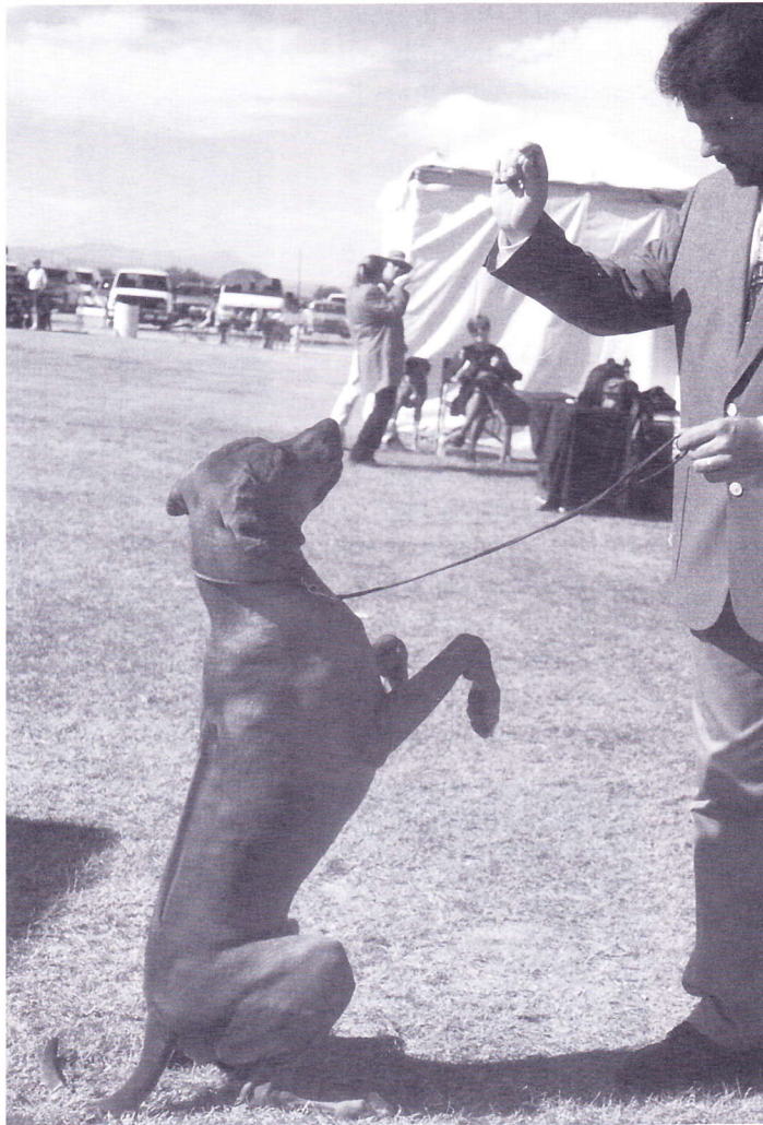
Showing off some trick dog skills!

W e couldn't be more proud of Kobe's accomplishments in the show ring and performance venues, but his enduring legacy is as an influential sire of his generation. With limited, carefully considered breeding, he was a RRCUS top ranked Stud Dog for seven years, including #1 in