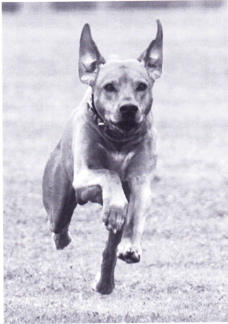
Bunny chasing at age 11, 2009

us while wiggling in place, a big smile of doggy joy on his face. At Christmastime, he always enthusiastically unwrapped his presents using his paws and teeth, paper flying everywhere, then exuberantly raced around the yard, cheerfully tossing his new toys in the air.