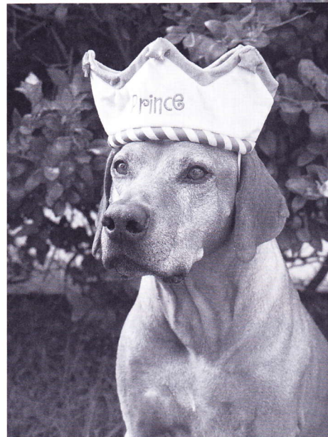
Left: Handsome Prince, 10 th BD 2008

resulted in a shattered cereal bowl. The shock of debris flying everywhere and his Mom's verbal response to said debris was enough to prevent him from ever trying again. He had a goofy streak, coupled with a great sense of humor. A notorious ladies man (human and canine), he once ran headlong into a tree as he trotted around our yard with a toy in his mouth, because he was too busy flirting with our house sitter to pay attention to his surroundings. He loved to vigorously rub his head on