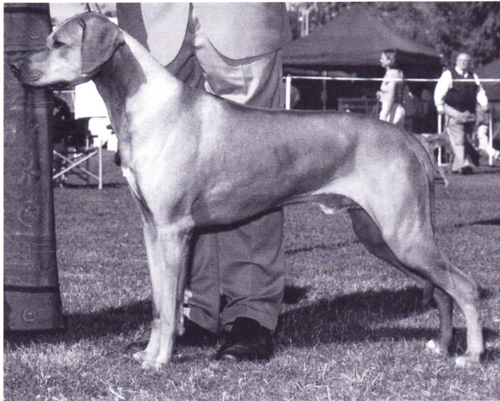
Mt. Palomar 2003, Best of Breed Monica Canestrini/Group 1 Jerry Watson

leg, placing first in the class. Kobe continued to compete in both conformation and agility as time permitted – sometimes on the same day! On more than one occasion, Kobe successfully navigated agility courses handled by Mike dressed in a shirt and tie, then raced over to the conformation ring to compete as a special. We'd