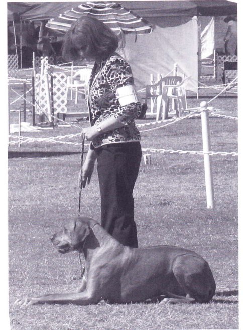
On Rally course with Mom, 2009