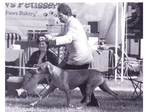
Above: On the go