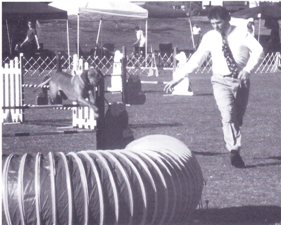
Left: Multitasking with Dad – agility, then conformation Scottsdale 2001