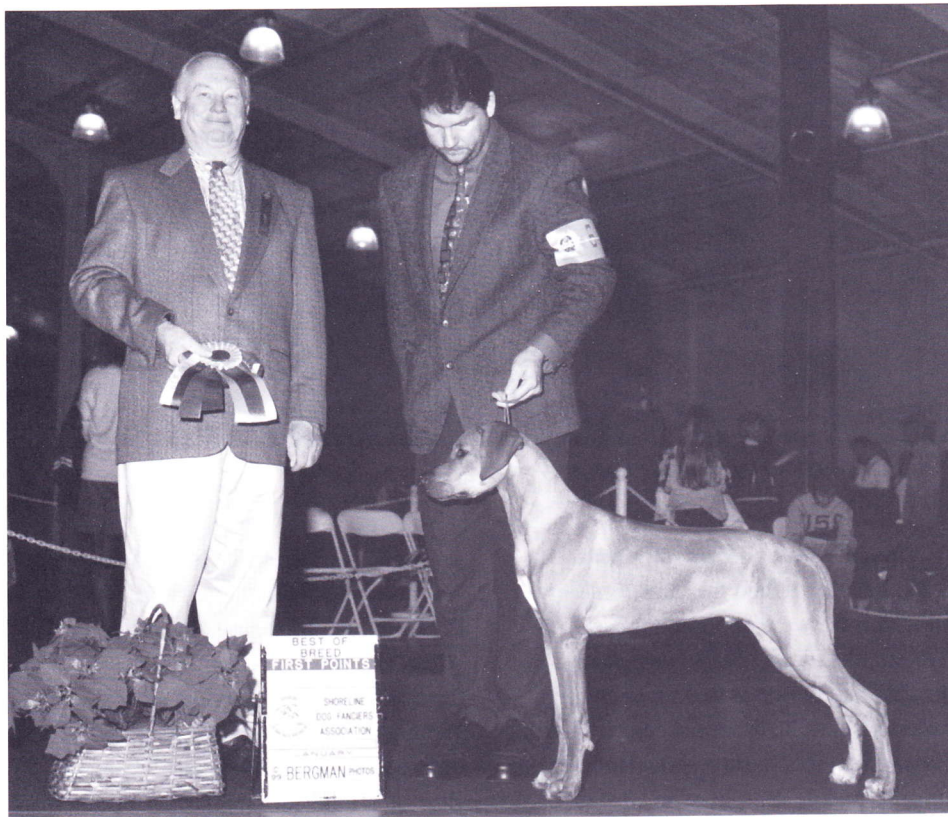
Winners Dog, Best of Winners and Best of Breed on 6th month birthday. January 1999