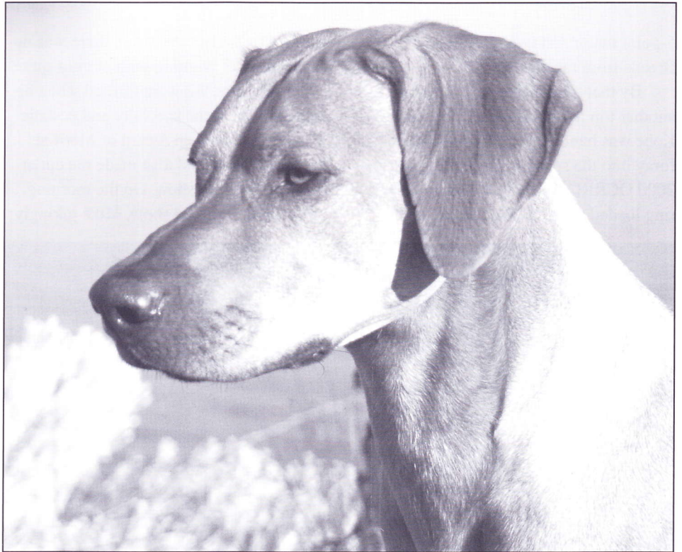
Kobe 2001