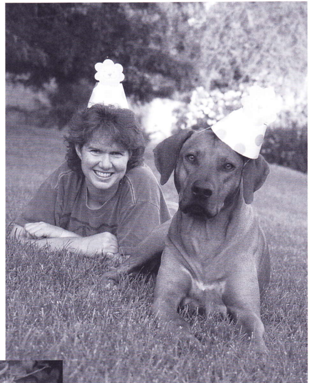
Above: 4 th Birthday celebration, 2002

Kobe was a consummate gentleman – a wise old soul encased in a dog suit. He was incredibly intelligent and very social with people, dogs and other animals, and extremely sensitive and empathetic, always striving to please. His one and only attempt at counter surfing